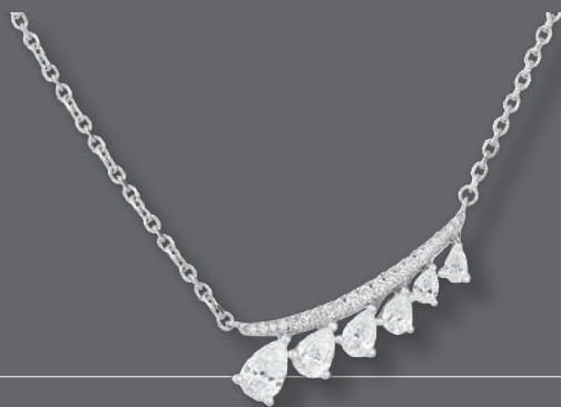
NECKLACE WITH PENDANT

18k white gold, set with pear-shaped and brilliant cut diamonds totalling 0.95 carats.